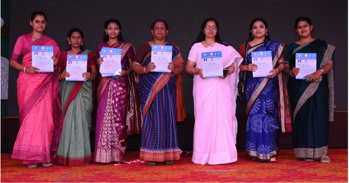
Release of One Stop Centre Annual Report