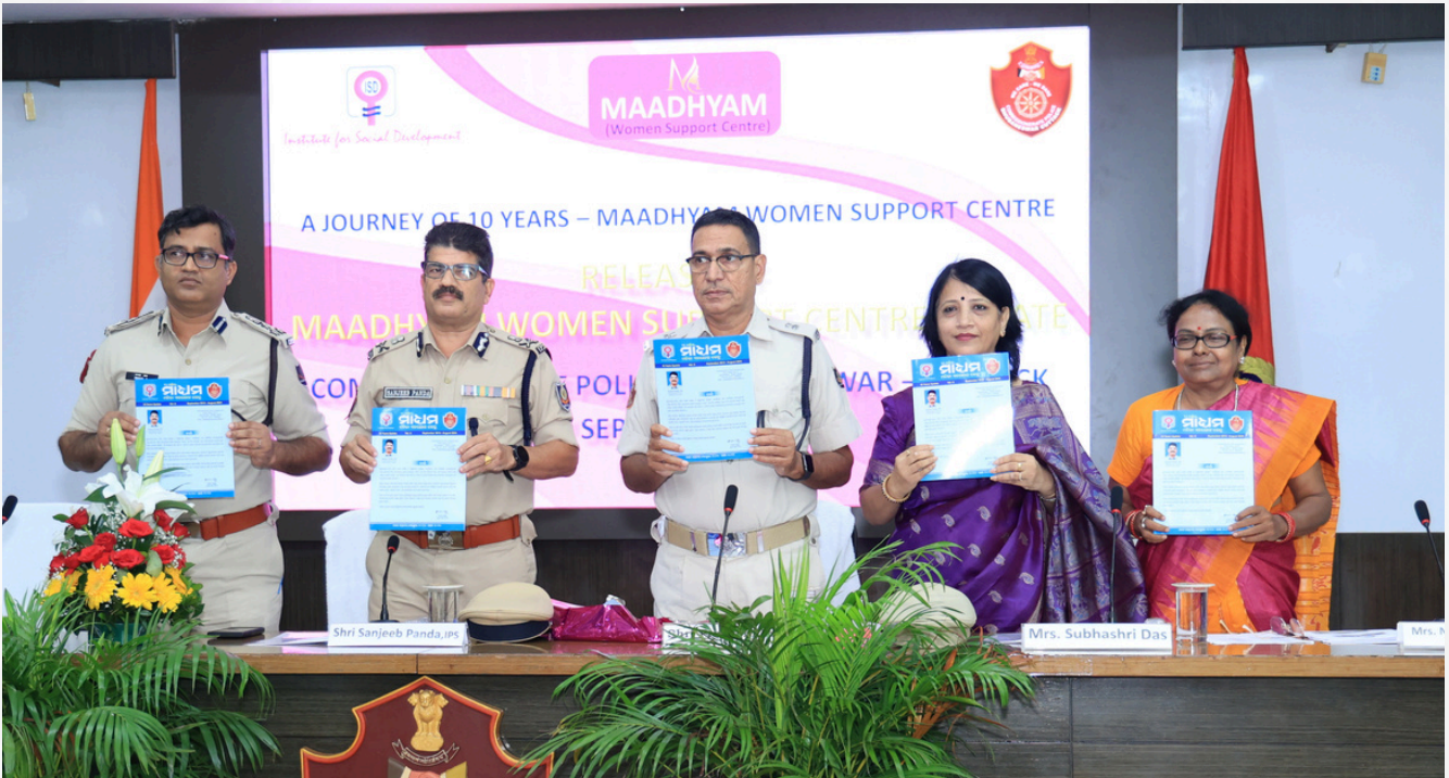
Release of Maadhyam Women Support Centre Update